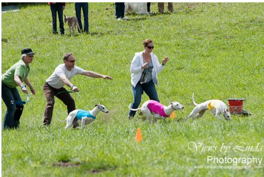
This looks like a white whippet race ☺

CKC Offices: 200 Ronson Drive, Suite 400, Etobicoke, ON.M9W 5Z9Phone: (416) 675-5511